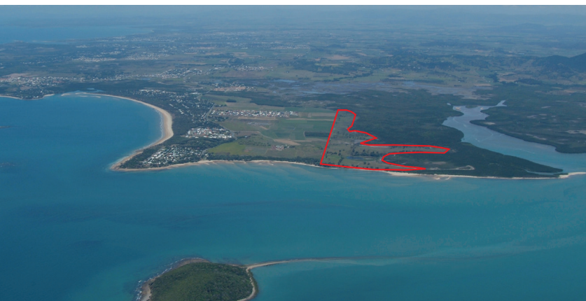
Shoal Point Bay Estate

Aust Pro has been appointed as the Asset Consultant specialising in investments associated with the Significant Investor Visa in Australia. As the Asset Consultant, Aust Pro will provide asset allocation advice and execution services for property developments and alternative assets, including Australian owned companies.